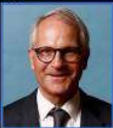
H.E. Amb. Pfaffernoschke