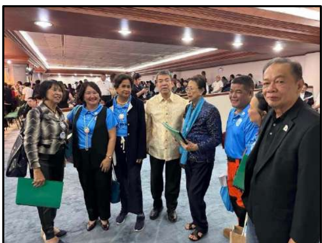
With Senator Koko Pimentel