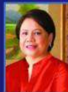
Senator Cynthia Villar

Please join us at DZRH Radyo Balintataw for sharing the significant triangulated conference on UN concerns for Youth, Indigenous Peoples & workers for 60th UNCTAD Anniversary held at the Senate headed by SP Chiz Escudero on August 12 through the sponsorship of Senator Cynthia Villar , Chair of the Committees on Agriculture, Environment & Climate Change who provided the keynote address while the closing remarks were provided by Senator Joel Villanueva , Chairman of the Committee of Labor & Human Resources .