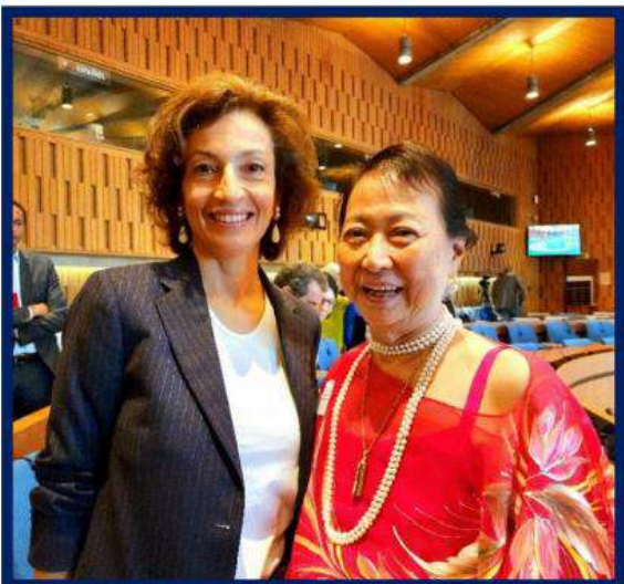
With UNESCO Director General Audrey Azoulay

I wish your voices will be heard to convey our shared message for a sustainable future for all, and to celebrate the creative force of youth and the wisdom of Indigenous Peoples in protecting our planet and strengthening the foundations for peace.