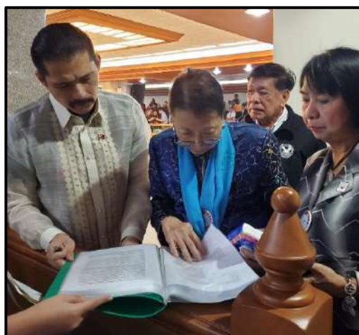
With Senator Robin Padilla