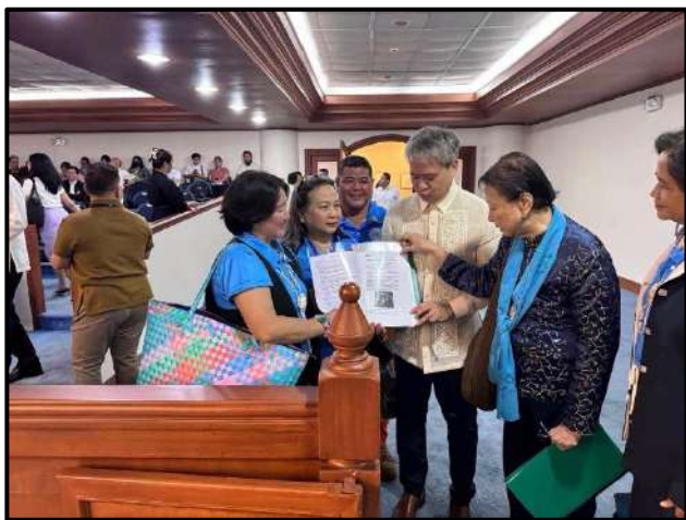
With Senator Joel Villanueva