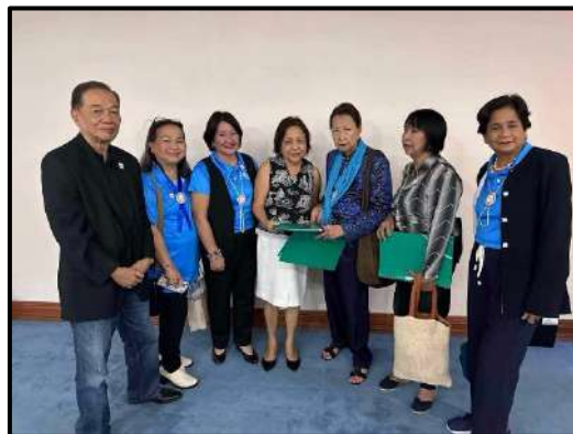
With Senator Cynthia Villar