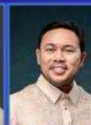
Senator Mark Villar