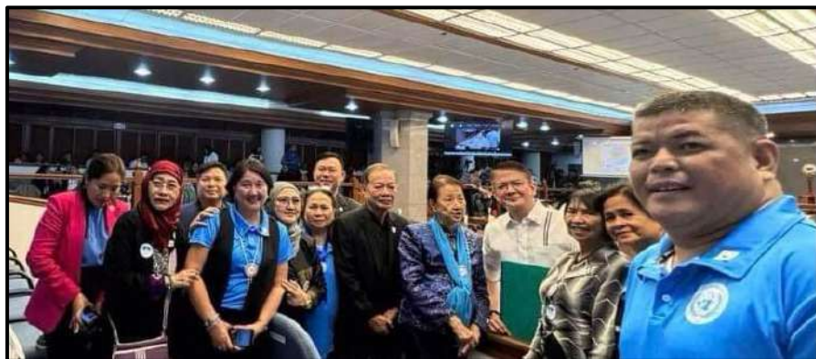
With Senate President Chiz Escudero