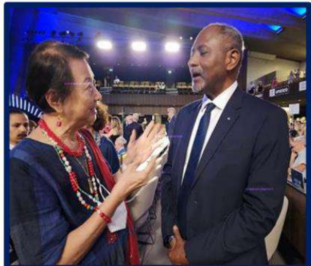
With UNESCO Assistant Director General