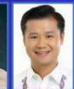
Senator Win Gatchalian