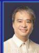
Senator Joel Villanueva