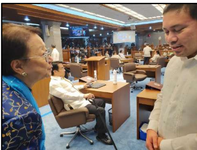
With Senator Mark Villar