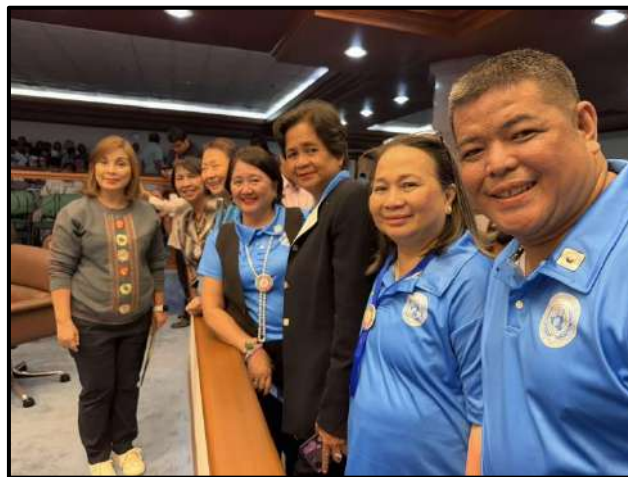
With Senator Loren Legarda