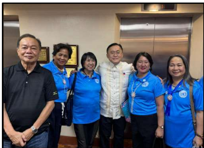
With Senator Bong Go